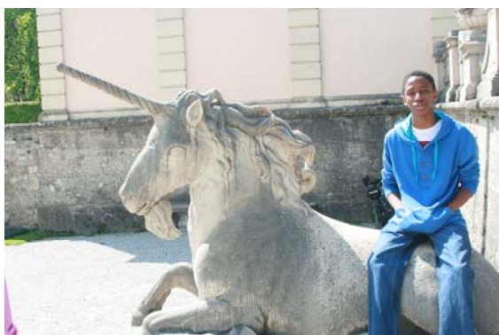
Keagile on the unicorn