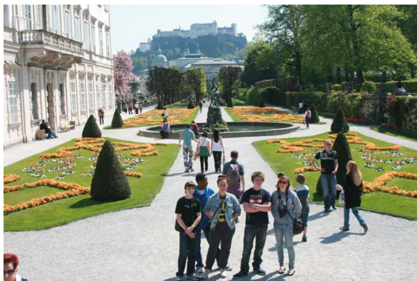
Most famous view from Salzburg