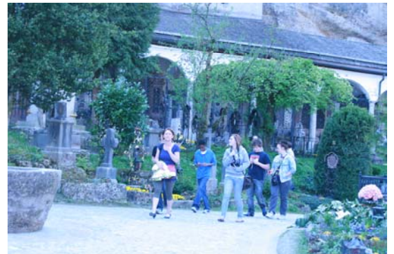
On the cemetery