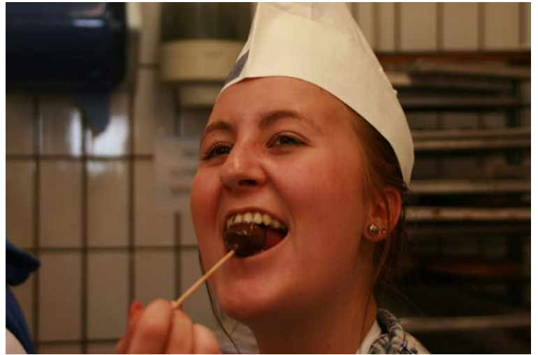
then get it in the mouth.....