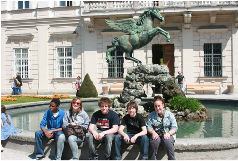
In the Mirabell Garden