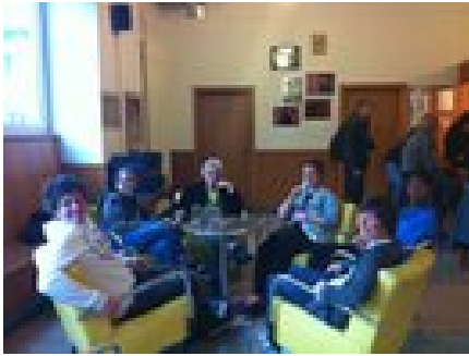
movie night in Ebensee...quite an experience ☺ hahahahah