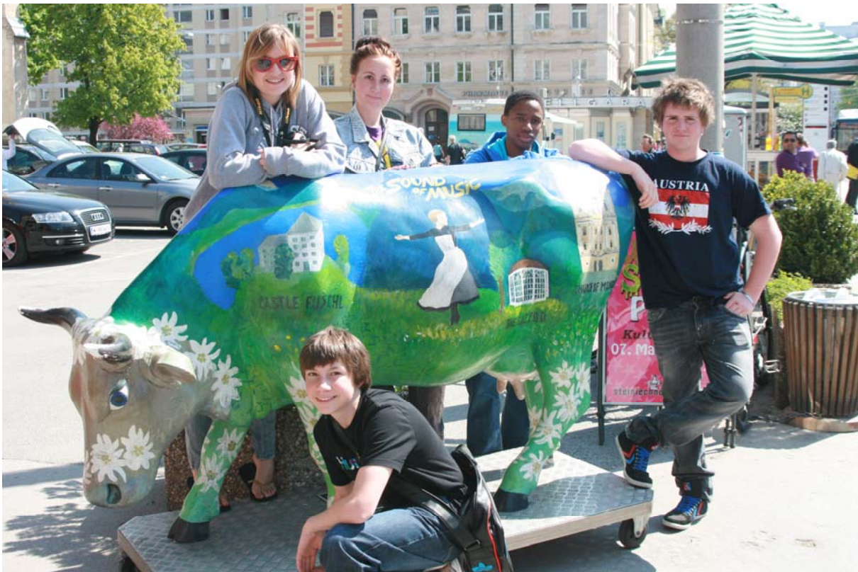
The "Sound of Music" tour