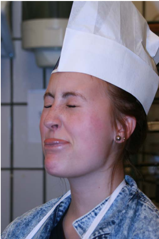
And now see the face....one absolutely excited student